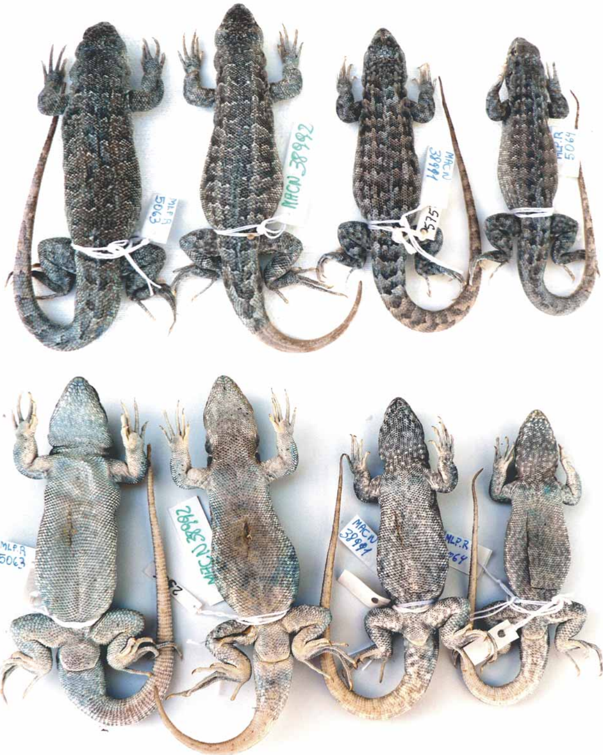
FIGURE 2. Dorsal and ventral color variation in the type series of Liolaemus puelche .

Dorsal body scales subtriangular to obovate, moderately imbricated. Twenty three to 25 longitudinal rows with scales with distinct but blunt keels, a few with an apical scale organ. At midbody, dorsal scales grade laterally into smaller scales, smooth, imbricate, many with an apical notch. Scales anterior to, above, and posterior to forelimb and hind limb insertions, small, smooth, non-overlapping, becoming granular close to the insertions. Ventral body scales smooth, flat, imbricate, with an apical notch; subtriangular to obovate, same size or smaller than dorsal body scales. Scales around midbody 71; scales between occiput an anterior margin