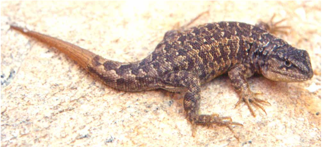
FIGURE 1. Liolaemus puelche , holotype adult male (MACN 38992), from south side of Ruta Nacional 40, 3 km N Ranquil Norte, Malargüe Department, Mendoza province, Argentina.

convex. Six internasal, two median, almost quadrangular; four lateral in tandem, a smaller one in front and a long and narrow scale in back. Two frontonasals rows in front, two paired scales in wider contact in medial position, two smaller lateral scales in contact with nasals. Along the back, a row of five scales, three about equal in size and subpentagonal in medial position; lateral frontonasals rhomboidal equal in size each other, and in wide contact with second canthal. Nine prefrontals, anterior three regularly arranged, with a small medial and two lateral more that three times larger; a second row of three scales with a medial scale larger than laterals; a third row with two scales in tandem in the left side, and a single scale in the right side. Frontal scale irregular, slightly larger that last prefrontals. Seven frontoparietals irregular in shape, smaller that frontal and parietal. Interparietal pentagonal with a large and conspicuous white cream “eye” in the middle.