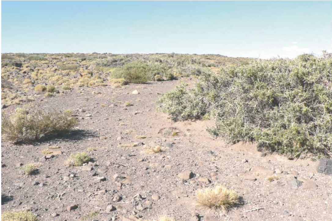
FIGURE 4. General view of the type locality of Liolaemus puelche from a northern perspective. Lizard activity was more intense under the large shrubs of Schinus johnstonii .

Dorsal background color brown to tan, recently captured adult males have a yellowish-green sheen. Dorsal head scales with brown, tan and white speckles. Most individuals boldly marked with holotype pattern, maintaining the pattern of transversal bands with variations in spots shape and distinctiveness. Variation more frequent on dorsal neck area by fusion of spots. Ventral surfaces of subadults tinged with gray, throat with light gray spots and light gray variegations.